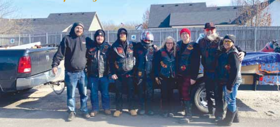
Helping Hands Coat and Sock Drive for the Homeless helping them to stay warm.